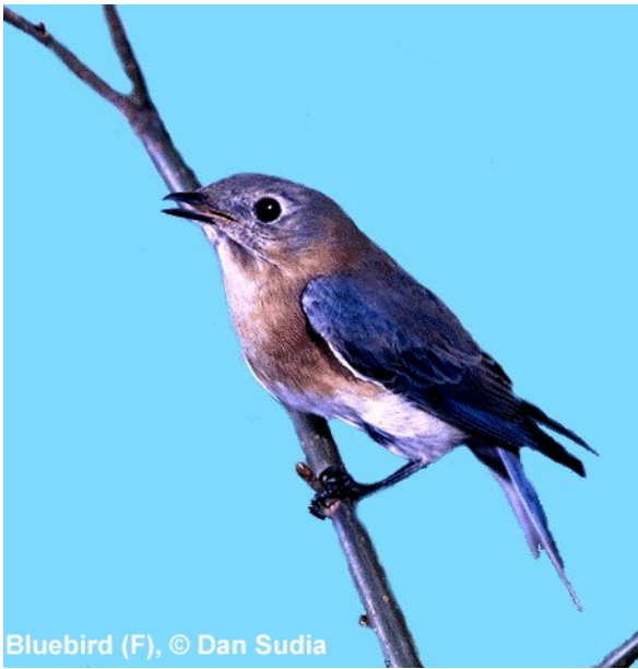
Bluebird (F)

A LANDLORD'S ULTIMATE DREAM IS TO HAVE A TRIHABITATION OF ALL THREE SPECIES