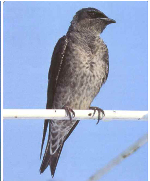
Adult female purple martin